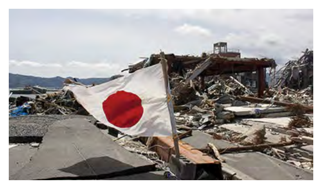
Figure 1 Devastation of March 11, 2011 earthquake in Honshu, Japan.

In 2010, a major earthquake struck Haiti, destroying or damaging over 285,000 homes<sup>[19]</sup>. One year later, another, stronger earthquake devastated Honshu, Japan, destroying or damaging over 332,000 buildings,<sup>[20]</sup> like those shown in Figure 1. Even though both caused substantial damage, the earthquake in 2011 was 100 times stronger than the earthquake in Haiti. How do we know? The magnitudes of earthquakes are measured on a scale known as the Richter Scale. The Haitian earthquake registered a 7.0 on the Richter Scale<sup>[21]</sup> whereas the Japanese earthquake registered a 9.0.<sup>[22]</sup>